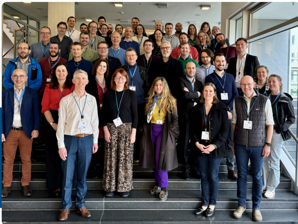
Team Members at the AIML4OS Kick-off Meeting in Wiesbaden

On April 2nd and 3rd, the kick-off meeting of the ESSnet One-stop-shop Artificial Intelligence and Machine Learning for Official Statistics (AIML4OS) was held at the Federal Statistical Office of Germany in Wiesbaden. During the meeting, the WP coordinators presented the planning activities and the expected intermediate results. This four-year project brings together a consortium of 15 countries with the goal of developing and sharing innovative solutions based on Artificial Intelligence and Machine Learning to enhance statistical products and processes.